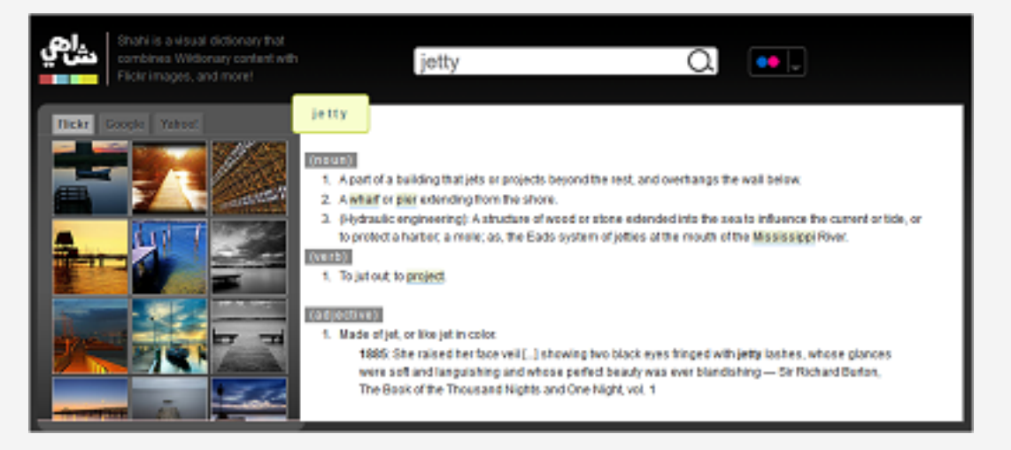
"Jetty" as defined by Shahi

Looking for a visual thesaurus? Then Lexipedia is for you. Simple to use. Just type in any word and Lexipedia instantly displays the target word along with other words. It also color-codes the words by both parts of speech and relationships. As you hover over a word, a complete definition is displayed.